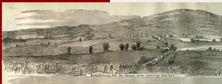
"Emmettsburg [sic], MD. Gen. Meade's Army pursuing Gen. Lee" from a sketch by Edwin Forbes, in Frank Leslie's The Soldier in Our Civil War , 1885.