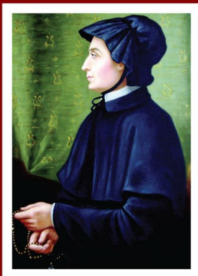
A former resident of Emmitsburg, Elizabeth Ann Seton (August 28, 1774 – January 4, 1821) was the first native-born citizen of the United States to be canonized by the Roman Catholic Church.

After playing host to native peoples for centuries, Catoclin Mountain has served home to European settlers since the 1730's. Among the first to come to what was considered "the backlands of the province," were descendants of English Catholics who had founded Maryland in 1634.