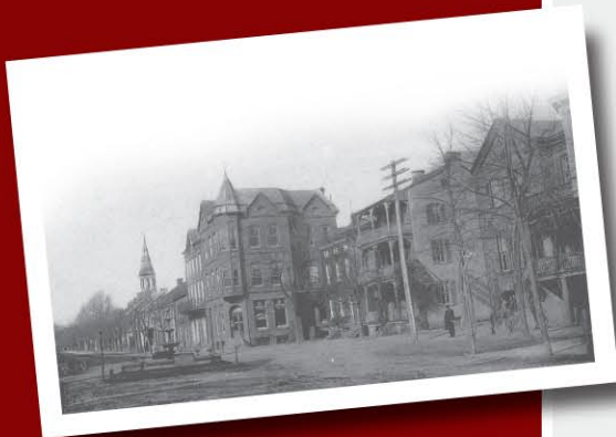
Vintage scene of Main Street and Town Square featuring a four-tiered fountain originally installed in 1885 (and destroyed in 1927).

The former St. Joseph's College is now the site of the National Fire Academy and features a national memorial dedicated to those fire and rescue professionals who have lost their lives in the line of duty.